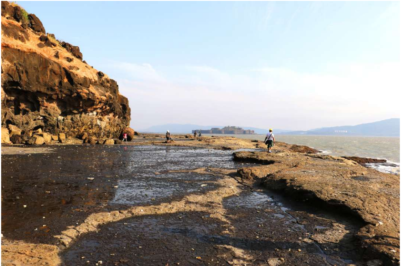
Fig. 4. A typical wave-cut platform at Janjira-Murud c. 140 km south of Mumbai along the west coast of India. This view looking towards the south shows the hilly terrain around the area and the Janjira sea fort in the background. Such sub-horizontal exposures along rocky stretches provide a wealth of geological knowledge on the tectonics of the Deccan large igneous province (e.g. Dessai & Bertrand 1995; Hooper et al. 2010; Misra et al. 2014; Misra & Mukherjee 2016 ).