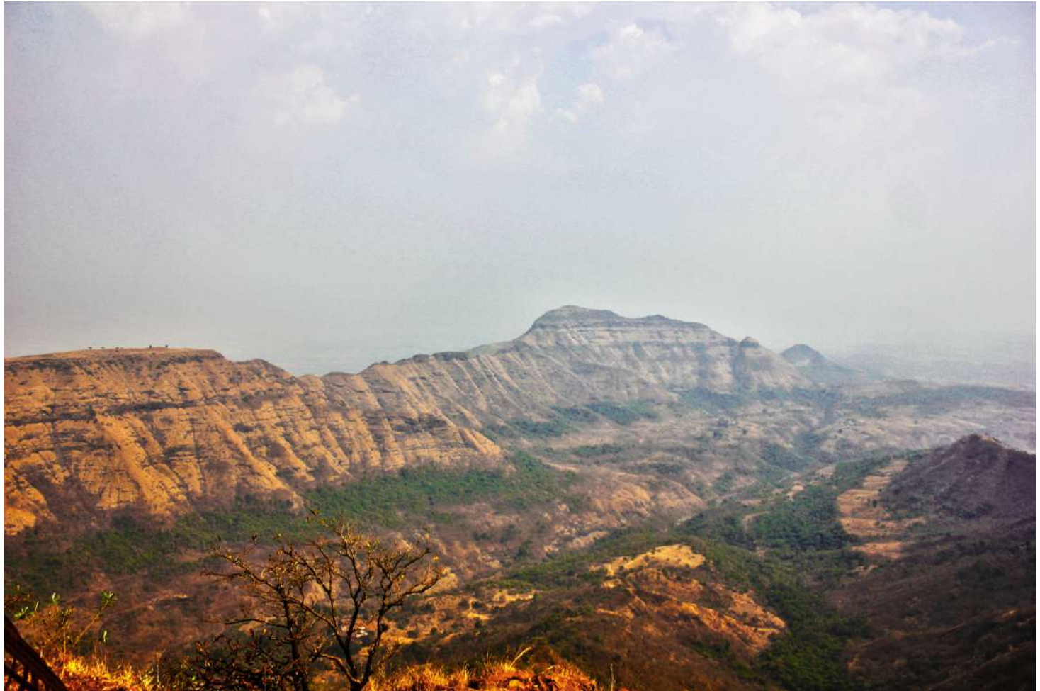
Fig. 3. Southern ridge of the c. 1000 m high Matheran Plateau showing sub-horizontal to gently dipping flows of the Deccan large igneous province. View looking towards the south; Photograph by Achyuta Ayan Misra.