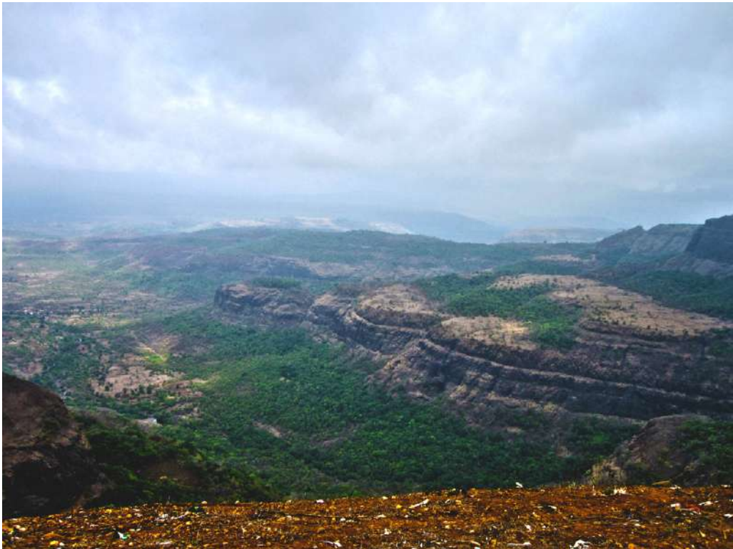
Fig. 2. View of sub-horizontal lava flows of the Deccan large igneous province looking towards the west from Lion Point in Lonavala, c. 100 km east of Mumbai. This location is on the top of the Western Ghat Escarpment; Photograph by Achyuta Ayan Misra.

Misra et al. (2016) studied carbonate seismic facies and subsidence on the ridges in the NW Arabian Sea to analyse how the Deccan mantle plume affected the tectonics of the offshore region of the DLIP. Gupta et al. (2016) detail seismicity based on several geophysical techniques in the Koyna region, where the periodic loading and unloading of water has been envisaged for seismicity induced by artificial water reservoirs since 1967. Their preliminary borehole investigations revealed faults and foliation planes and more detail is expected from this research group in the coming years regarding subsurface structural geology at Koyna. Analyses of P-wave receiver functions by Mandal (2016) enabled him to delineate the crust–mantle structure below the Kutch rift zone. He attributed this complex structure to be a key causative factor of the recent lower crustal seismicity in the region. Rajaram et al. (2016) performed detailed magnetic studies on part of the Deccan Traps and identified seven subsurface lineaments. They correlated these lineaments in the magnetic anomalies with already known brittle shear zones, faults and river